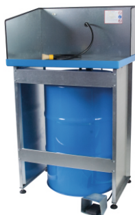
RKR 200/2E RKR 50/2 E