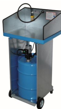
RKR 50/5 E RKR 80/5 E