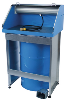
RKR 200/2 E-G RKR 200/2 E-2G