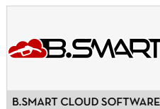
B.SMART CLOUD SOFTWARE