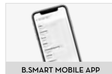
B.SMART MOBILE APP