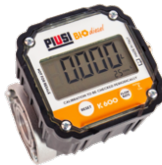
K600 B/3 B100