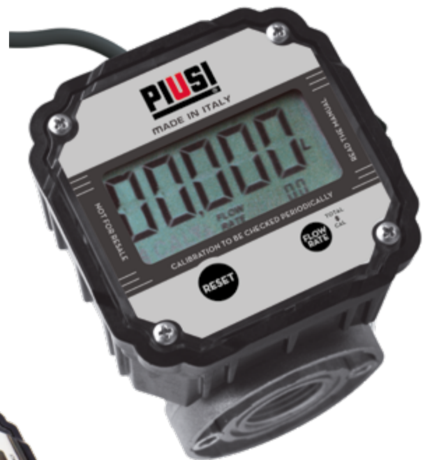
K600 B/3 METER