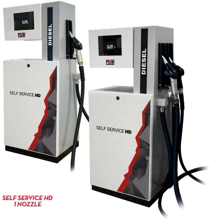
SELF SERVICE HD 1 NOZZLE

The dispensers are supplied sealed and certified, with no need for further certifications or calibrations after purchase.